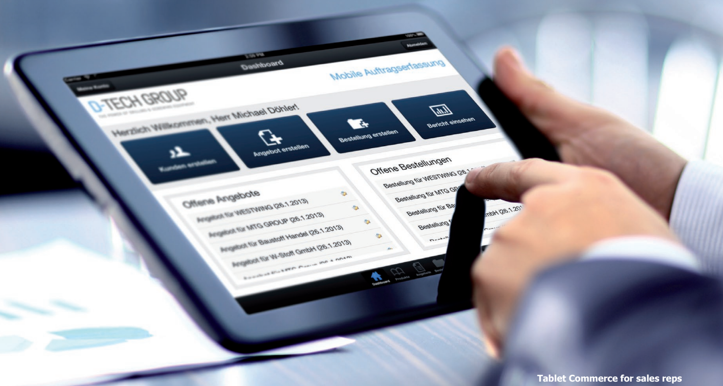
Tablet Commerce for sales reps